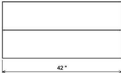
AT SINK CENTER SECTION