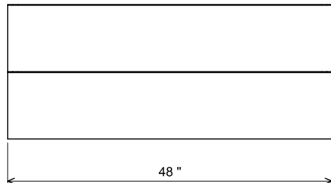
AT SINK CENTER SECTION